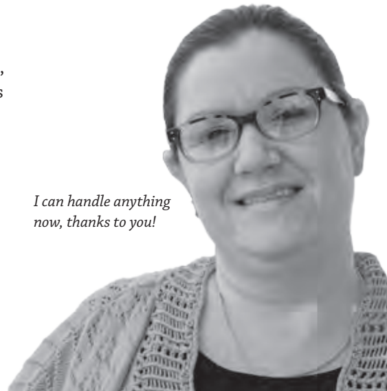
I can handle anything now, thanks to you!