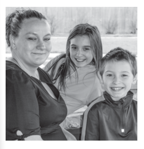
Thank you for giving me and my kids hope and the chance for a better life.

When I met my husband, I was 20. And outside of my father, he was the first true love of my life. Unfortunately, he was also a meth addict. So I became one, too. Meth