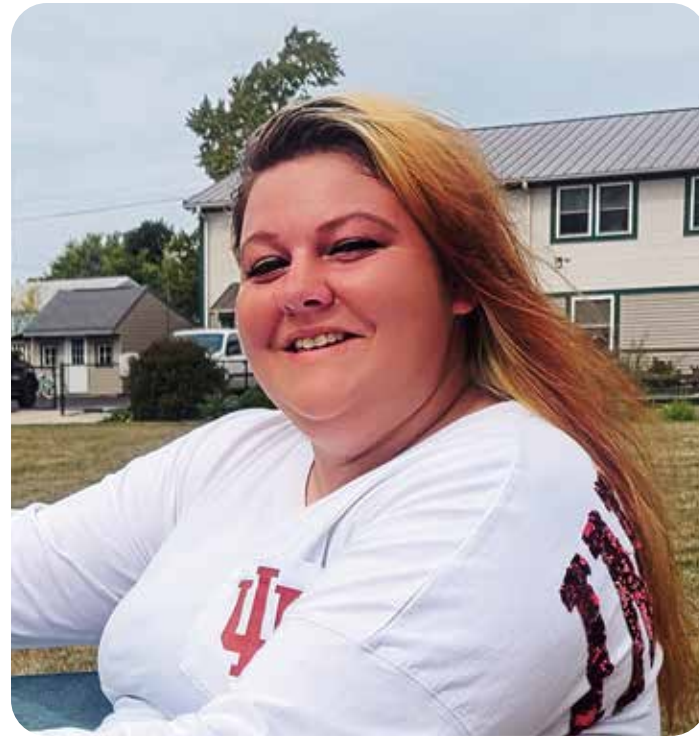
Thank you for helping your neighbors find their way!

She also credits the acceptance and warmth